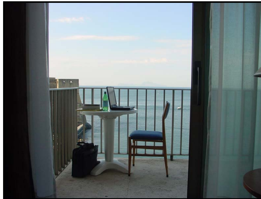
The magnificent view of the bay of Naples from the room in Hotel Royal, with the island of Capri in the distance

The city of Napoli is one of the oldest cities in all of Western Europe and the commercial center of the Campania Region. Founded more than 2,500 years ago by Greeks from the nearby town of Cuma, the city quickly developed into a bastion of Greek culture in the West. Its strategic location has been the object of many conquerors throughout history. In the medieval period and beyond, Napoli was ruled in turn by the Byzantines,