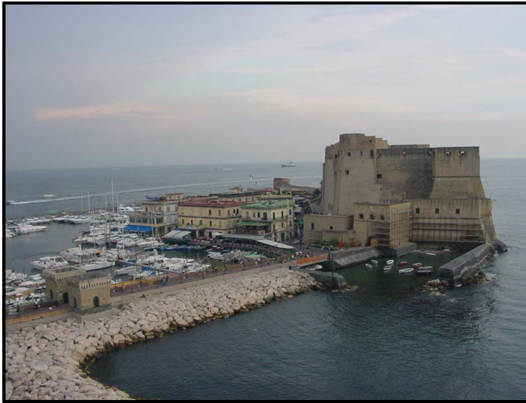
View of "Castel dell'Ovo from the hotel room in Naples.

population in Campania is somewhat irregular: certain inland areas are under populated, while the coasts are highly urbanized. The Province of Napoli, in particular, has a density of 2,617 inhabitants per square km., one of the highest in Europe. This imbalance is the result of centuries of drift by rural workers from the poorer areas, while the coastal cities (especially Napoli, the principal pole of attraction), lacking the manufacturing enterprises capable of absorbing such an abundant supply of labor (mostly unskilled), found that their own historical, social and environmental problems, rooted in unemployment and proliferation of the underground (black) economy, were severely aggravated. One of the major problems facing the coastal cities, particularly Napoli, is that of bad housing conditions in the overcrowded poorer quarters that are lacking the necessary social and public health infrastructures.