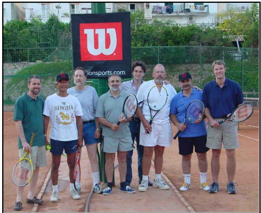
Participants of the BEDR Open at the "Capri tennis club".

ship itself until the tumultuous finale. The team of Professors missed three match points in the 4th game of the last set before digging deep to become the first champions of the tournament.